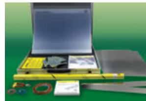
RSP Easy Starter Kit