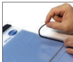
Pasting off line

Preparing die cutting base of RSP system is off line work. Measure actual product and paste knife and creasing rulers on the base blanket.