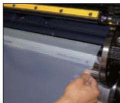
Mounting the base to the cylinder