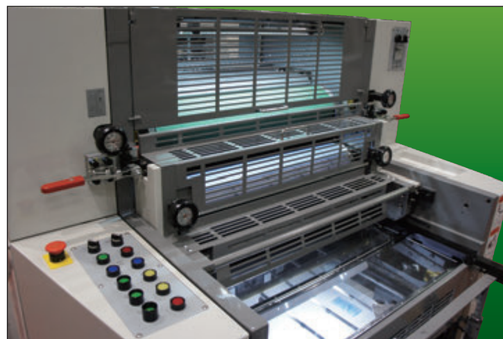
Delivery with numbering unit